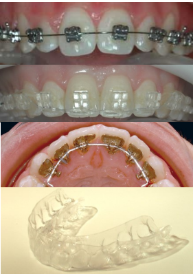
Metal, ceramic and lingual appliances, and a clear aligner.

more than beautiful smiles. Orthodontics is a specialist branch of dentistry concerned with the prevention and treatment of dental and facial irregularities. The technical term for these problems is 'malocclusion', which means bad bite . There are many different forms of malocclusion; most are inherited but some are acquired, e.g. by thumb sucking. Most problems can be corrected but often require fixed (train-track) braces for a period of 18-24 months.